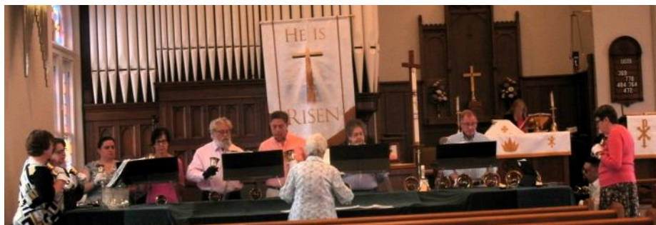
Trinity's Bell Choir—Sunday, April 21, 2024