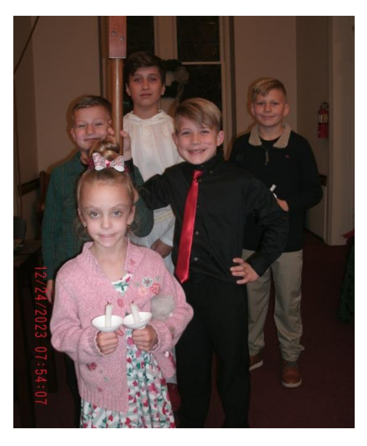
Christmas Eve worship service at 7:00pm was led by the kiddos! Check out Trinity's Facebook page for more photos.

others on the list and arrange a swap. Please notify the church office of the change.